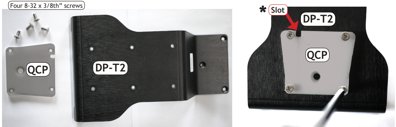
Quick Connect Plate (QCP) and DP-T2. Attach with four 8-32 x 3/8th inch screws (included with DP-T2) * Note the position of the slot at the upper left of the QCP.