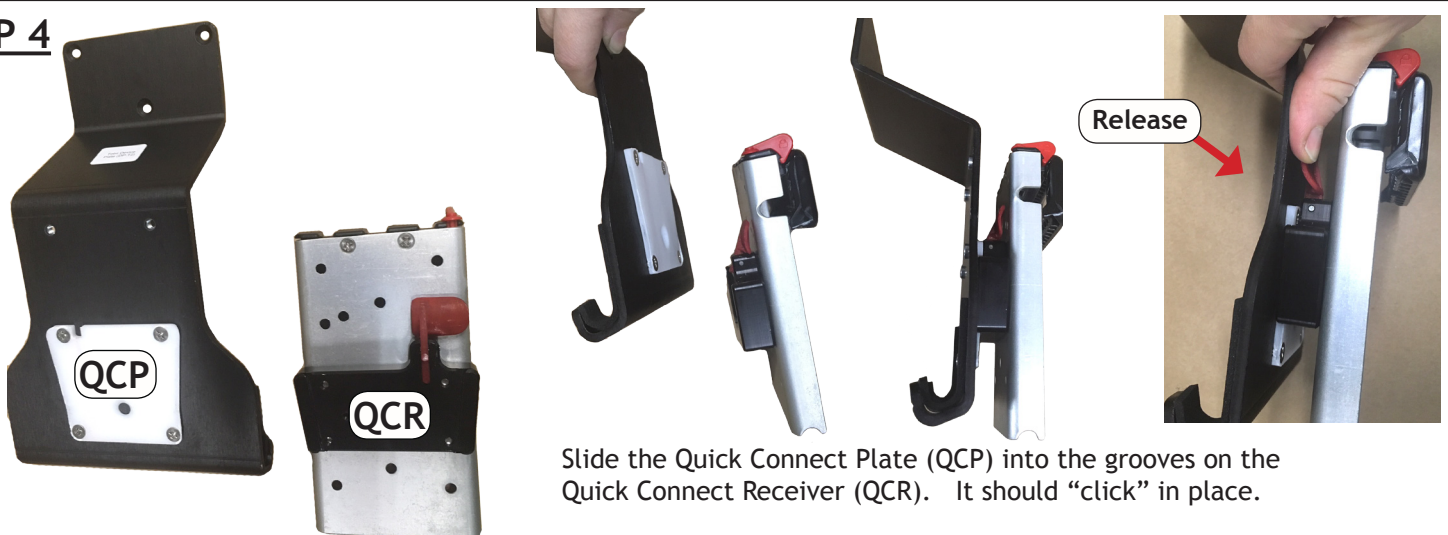
Slide the Quick Connect Plate (QCP) into the grooves on the Quick Connect Receiver (QCR). It should "click" in place.