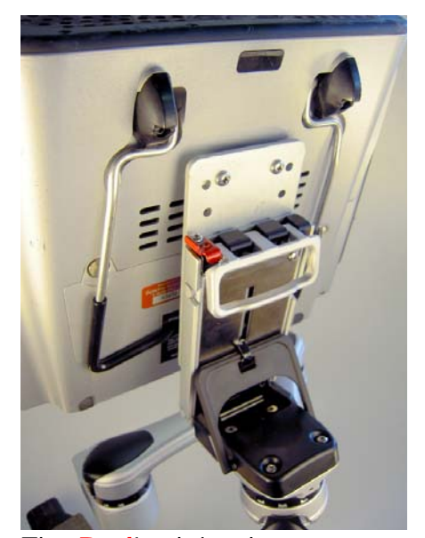
The Red Lock in-place.

A person needs to intentionally rotate the Red Lock out of position to lift the Handle and remove the device.