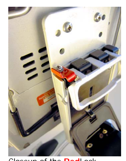
Closeup of the Red Lock